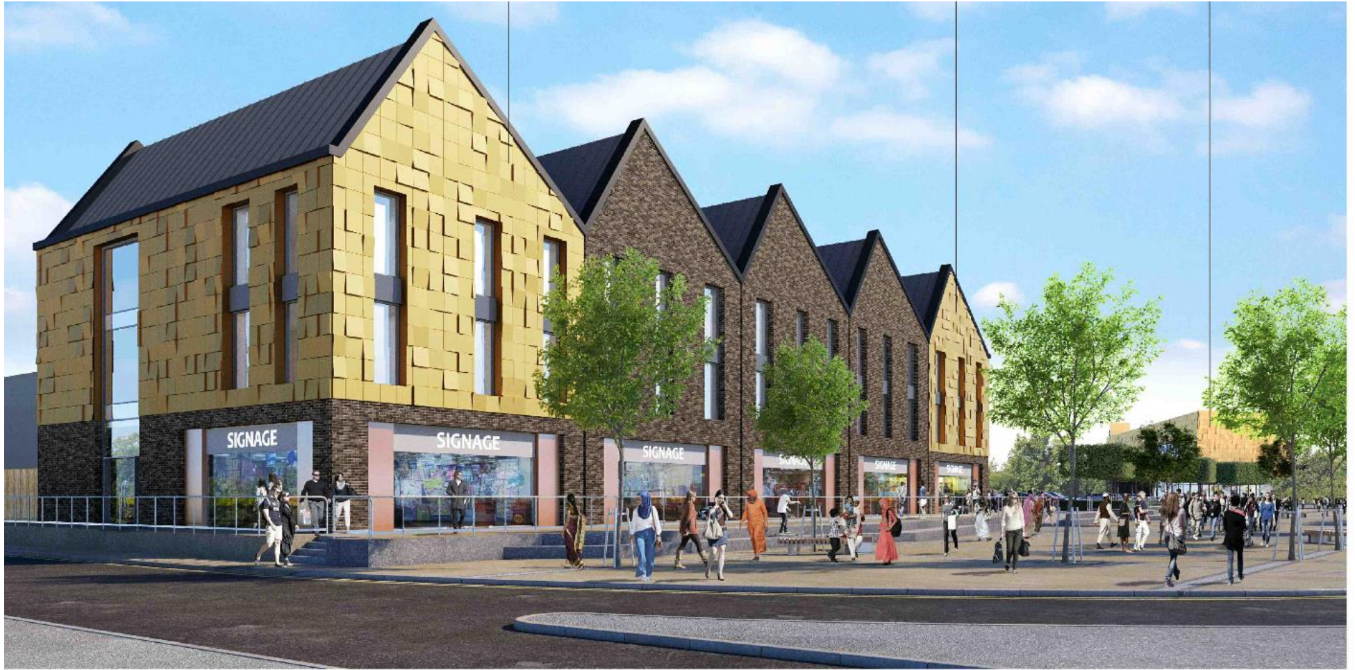
Visual 2 from Belgrave Road